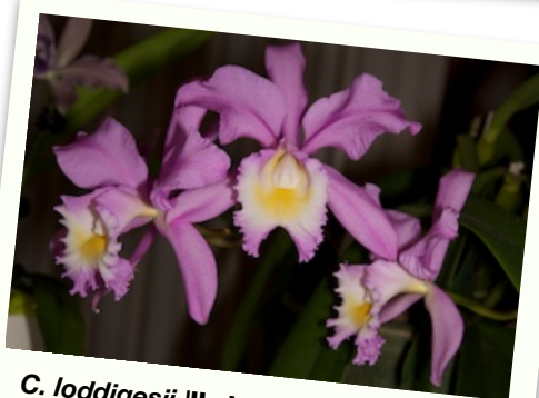
C. loddigesii 'Herbrita' x C. gaskelliana