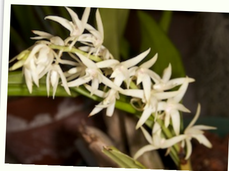
Eria fragrans – Merle Robboy